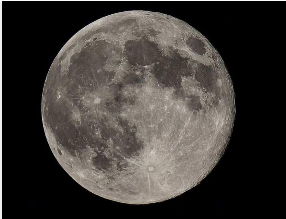
The Moon was the first object whose distance was accurately measured.

The first distance to be measured with any accuracy was that of the Moon. In the middle of the 2nd century BCE, Greek astronomer Hipparchus pioneered the use of a method known as parallax . The idea of parallax is simple: when objects are observed from two different angles, closer objects appear to shift more than do farther ones. You can demonstrate this easily for yourself by holding a finger at arm's length and closing one eye and then the other. Notice how your finger moves more than things in the background? That's parallax! By observing the Moon from two cities a known distance apart, Hipparchus used a little geometry to compute its distance to within 7% of today's modern value – not bad!